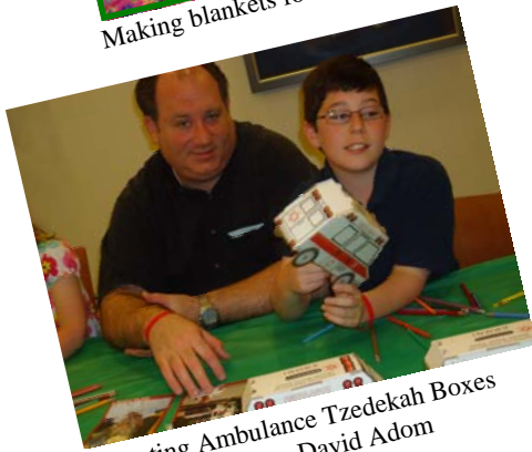
Creating Ambulance Tzedekah Boxes for Magen David Adom

Yom Ha'atzmaut and Mitzvah Day at Temple Emanu El