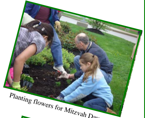
Planting flowers for Mitzvah Day