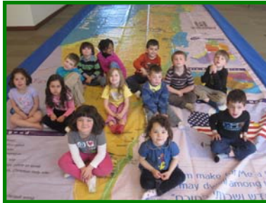
Preschool students visit Israel during their Ha'atzmaut celebration.