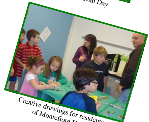
Creative drawings for residents of Montefiore Home

Yom Ha'atzmaut and Mitzvah Day at Temple Emanu El