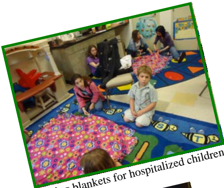
Making blankets for hospitalized children